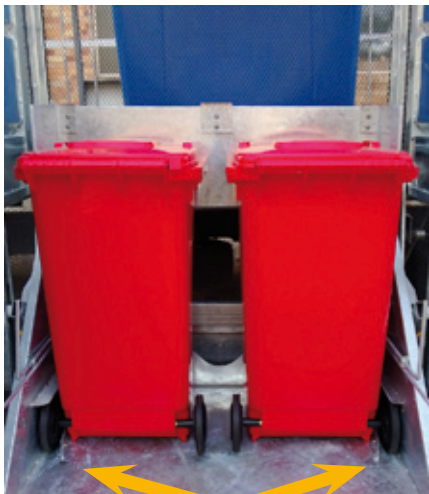
Outside Wheel of both bins held in place by wheel guides.

Ensure wheelie bin/s have their outside wheel/s WITHIN the wheel guides on the base & sides of the cradle (one wheel per bin inside the guides at the extreme left, and/or extreme right).