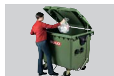
lid opening device