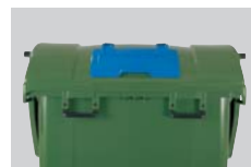
lid within a lid