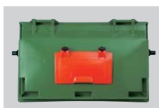
lid within a lid