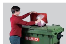
lid within a lid