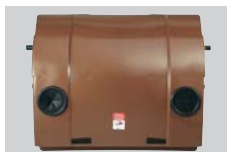
150 mm Ø