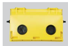
150 mm Ø