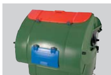
lid within a lid