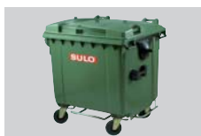
lid opening device