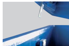
triangular lid lock