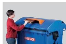
paper hood on top