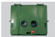
150 mm Ø