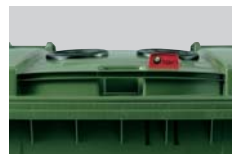
automatic lock 2303