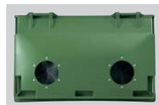
200 mm with rubber rosette